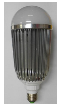
Socket Base: E27